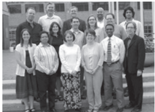
Young Scholars in American Religion 2005-2006