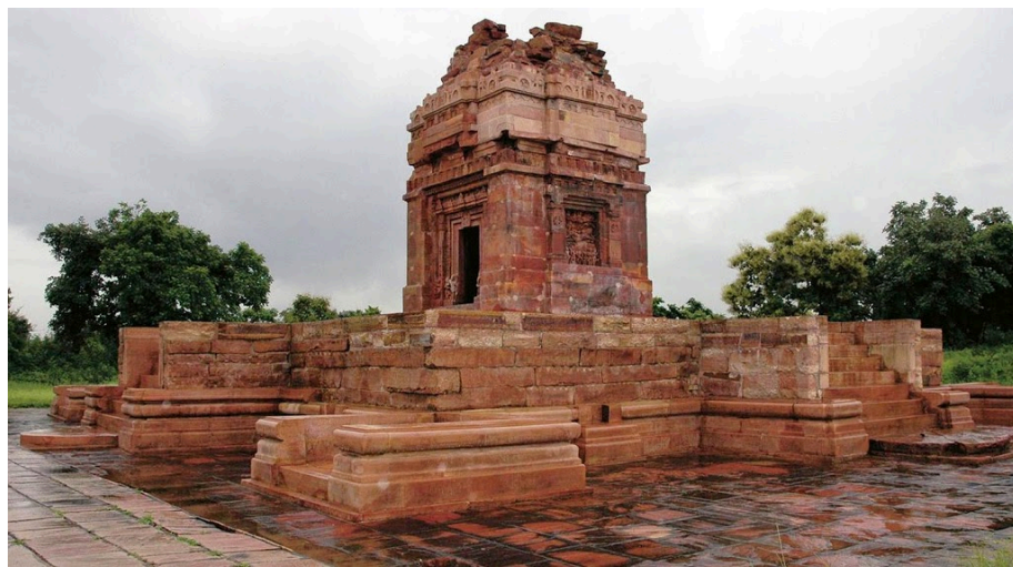
Vishnu Temple, Deogarh. Uttar Pradesh, India. Gupta dynasty, 530 ce

In this paper, you will discuss the Vishnu Temple , Deogarh (image 10-14) and the Relief panel in the Vishnu Temple, Deogarh titled Vishnu Lying on the cosmic waters (image 10-15). How do these works of art and architecture reflect the culture and ideas of Hinduism? How is the mandala incorporated in the architecture and design of the architectural structure? How is the Shakti portrayed in this relief? Address these questions in a word document in either MLA, APA, or Chicago style format; minimum of two pages required.